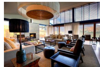
Spa Living Area