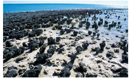
Hamelin Pool Stromatolites

Old Pearler Restaurant - is the only restaurant in the world built entirely from coquina shell carved from Shell Beach. Fresh local seafood is a specialty, with crabs and crayfish in season. Limited tables, must make advance reservations. 71 Knight Terrace, Denham WA6537. Tel: (08) 9948 1373